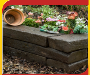
For the Garden