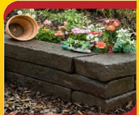
For the Garden